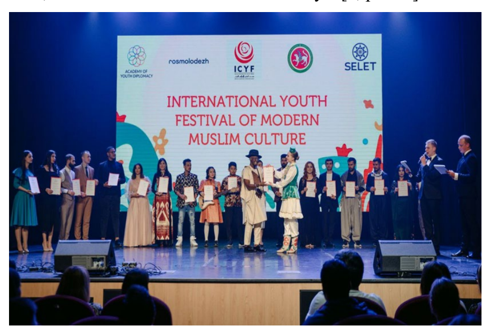
Pic.4. Gala-concert / Graduation ceremony in the direction of Music.

thoughtfulness of the space of this grandiose event – all components – design solutions, visual series, necessary tools and equipment, convenient zoning created a favorable atmosphere for creative communication and work on collaborations. Immersion in a single art space and this whole creative process contributes to the unification and cultural interchange of participants. As M. Bakhtin noted, during the holiday, "an individual feels like an inseparable part of the collective, a member of the mass national body" [1, p. 258].