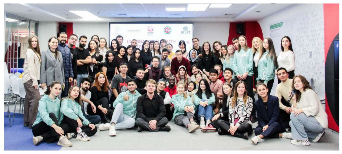
Pic.1. The organizers, volunteers and participants of International Youth Festival of Modern Muslim Culture. After the networking.

One of the bright and large-scale projects is the Youth Festival of Modern Muslim Culture, which was held from October 26 to 30, 2022 in Kazan. This event is part of the international program "Kazan - the youth Capital of the OIC 2022", organized by the Government of the Republic of Tatarstan, the OIC Youth Forum (Organization of Islamic Cooperation), the Ministry of Youth Affairs of the Republic of Tatarstan, the Academy of Youth Diplomacy, the Tatarstan Republican Youth Public Fund "Selet". The program was implemented with the support of the Ministry of Foreign Affairs of the Russian Federation and the Federal Agency for Youth Affairs (Rosmolodezh). The main aim of the project is to develop multilateral cooperation between the youth of Russia and the OIC countries, to identify and support the creativity of original authors, performers and creative teams of regions of Russia and foreign countries that are members of the OIC at the age of 18-35.